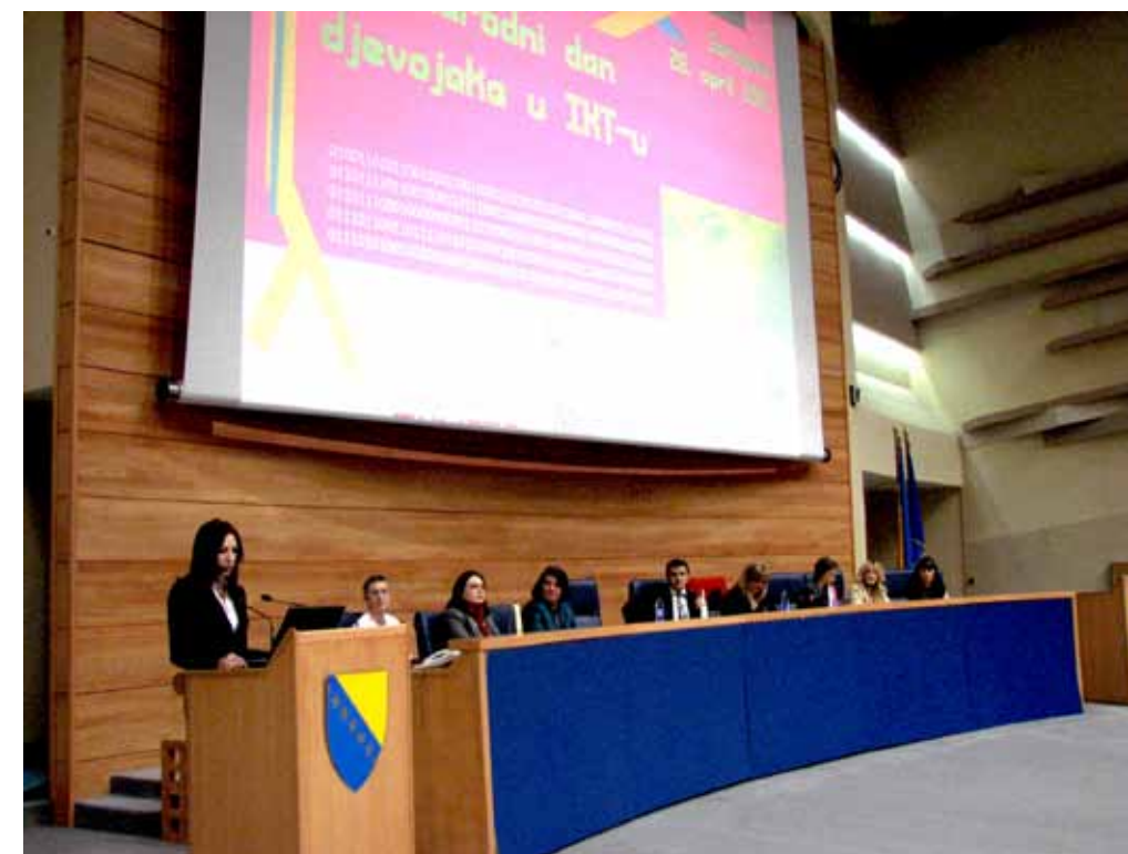
Opportunities for study, work and personal development that information and communication technologies offer to young women was in focus of International Girls in ICT Day marked in Sarajevo, Bosnia and Herzegovina, on 26 April 2012, with support of the RCC Secretariat.

In the framework of Electronic SEE (e-SEE) Initiative and with the aim to boost regional cooperation on Information and Communication Technologies, a high level conference on Information Society was co-organised by the RCC Secretariat, UNDP and the Albanian government. The conference approved an updated Electronic Agenda Plus, a key strategic document for information society development in SEE. UNDP has continued to contribute to the implementation of e-SEE Agenda Plus with its e-leadership project and through hosting the e-SEE Secretariat which is a vital instrument for supporting, guiding and providing visibility to the e-SEE Initiative. The political commitment achieved in November 2011 needs to be complemented with technical and financial support in order to ensure timely implementation of the Agenda. The RCC Secretariat also supports the development of concrete regional action that will help to that end. Establishing a long-term vision that is integrated with other economic and social development perspectives should also be a key priority in the near future.