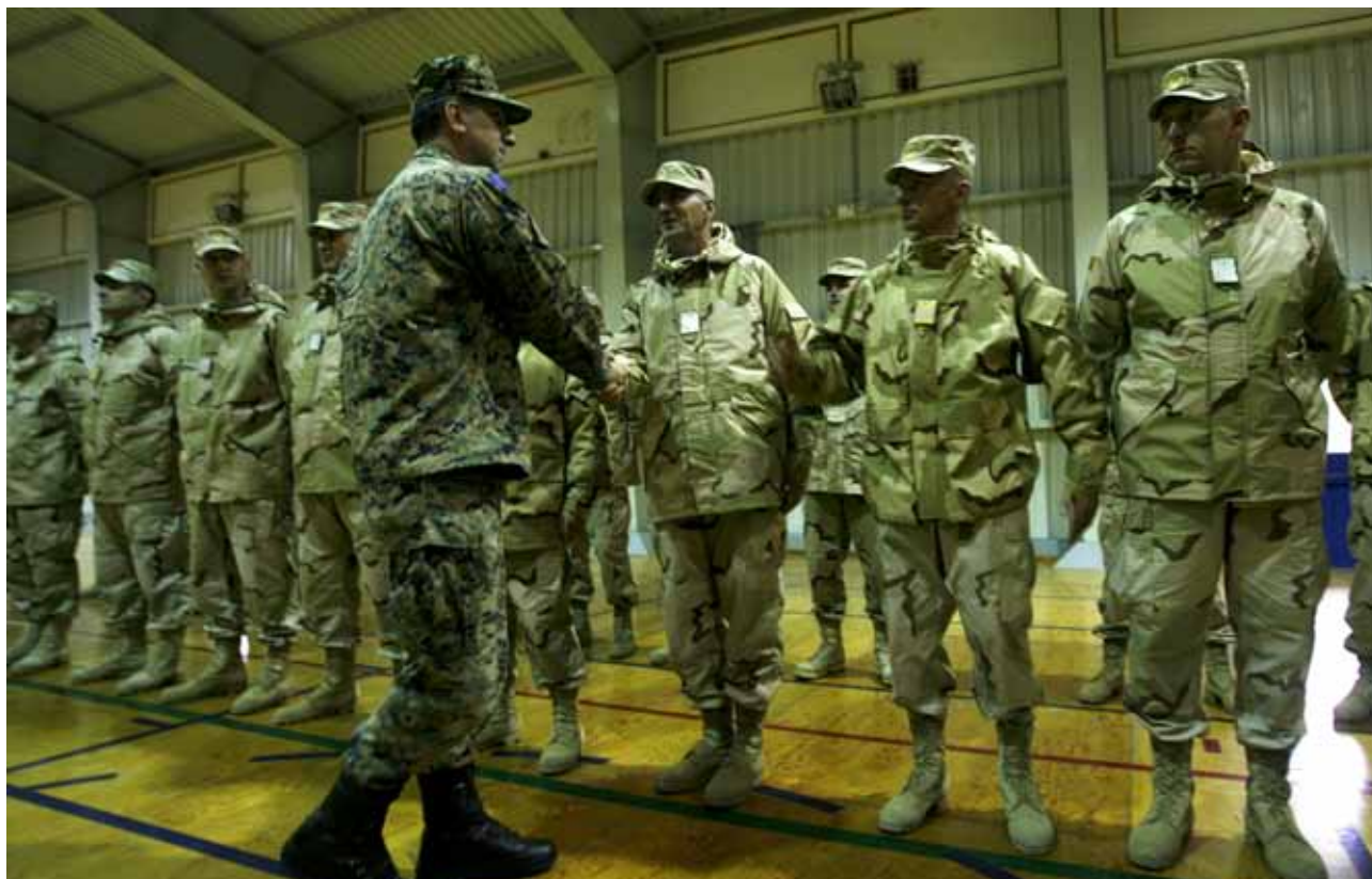
The RCC supports cooperation among the military intelligence in confronting regional security threats through organized and systemic joint efforts.

Based on the challenges and achievements in the first half of implementation of RCC SWP, the RCC Secretariat analysis indicates that the process of streamlining and avoiding duplication in the activities of the RI&TFs is still at the level of political statements rather than significant practical achievement. The different national interests mixed with different out-of-the-region national and international interests do not always act in a coherent manner. The RCC Secretariat will continue to ensure clear and sustained political support from its SEE members. Better coordination with all international organisations that are implementing programmes in SEE will also remain in the focus in order to achieve more efficient cooperation in the security areas.