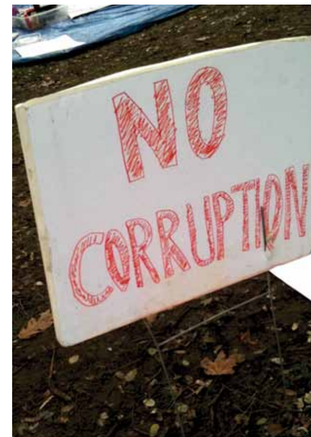
The RCC Secretariat continues to support existing initiatives in the area of fight against corruption.

The RCC Secretariat prepared the project, funded by the US State Department, on the establishment of SEE Judicial Training Network (SEEJTN) as a platform for integrated legal education on anti-corruption in the region, based on a common forum of cooperation between RAI and SEELS, in partnership with GIZ.