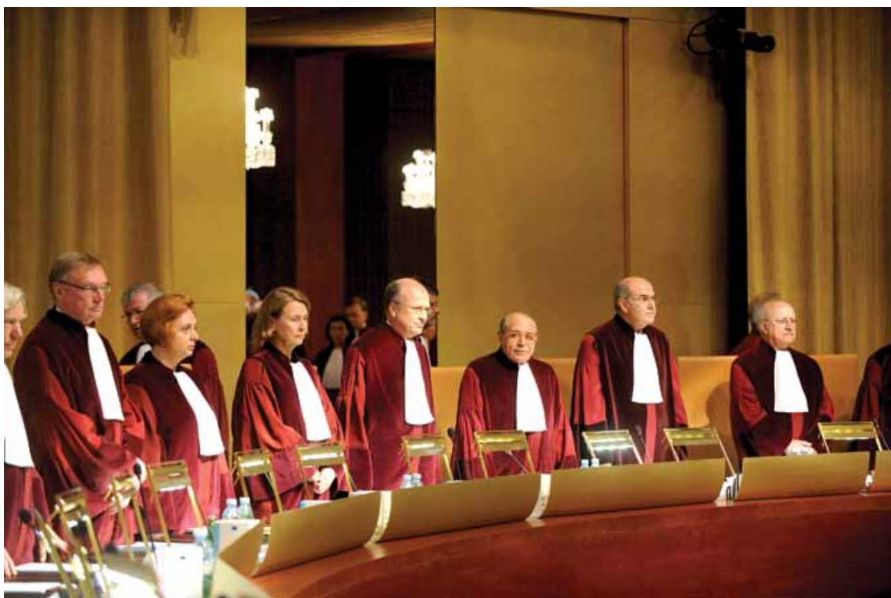
The RCC Secretariat has become not only the supporter of EC strategies in JHA area, but also an active partner in the implementation of ongoing projects

Under the RCC Secretariat coordination, and in cooperation with RACVIAC, the Steering Group on Regional Strategy (SGRS) decided to establish the Working Group on exchange of information and