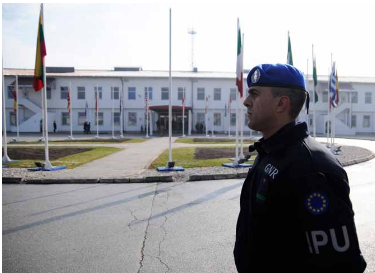
In the area of police cooperation, progress has been obtained by direct communication and exchange of information, consolidation of mutual trust and coordination among regional, EU and international actors.

The implementation of strategy triggered the necessary processes in order to achieve structural balance between police, law enforcement and judicial (prosecutors and judges) cooperation. In order to build the missing link, namely, to create a multilateral instrument for mutual legal assistance in criminal matters, the EU model could be replicated in a form of a regional arrest warrant. In this respect, the RCC Secretariat, in cooperation with Serbian SEEC C-i-O, established the Expert Group on mutual legal assistance in criminal matters to discuss the so-called