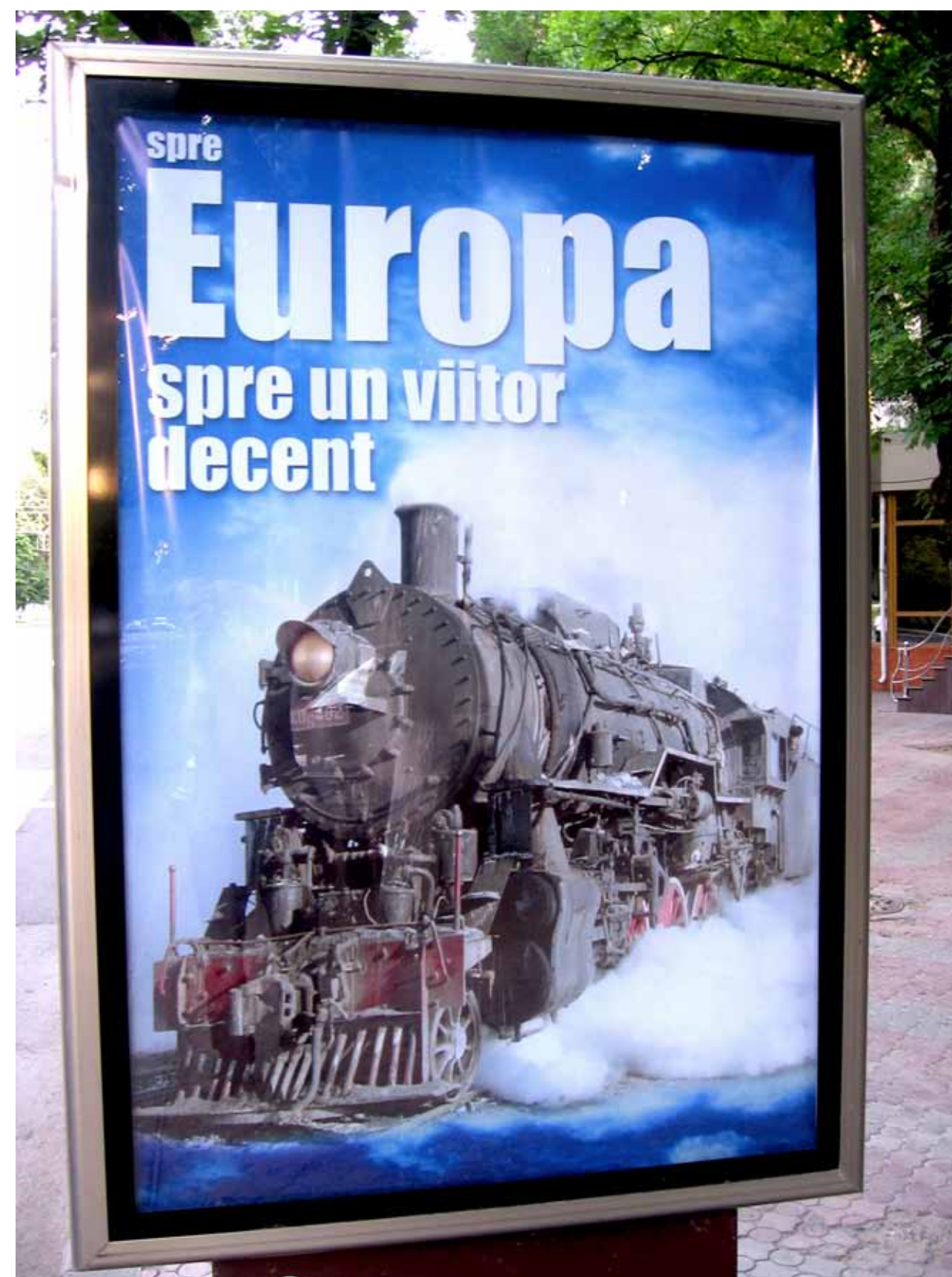
Towards Europe poster in Chisinau, Moldova.

Such an integrated approach - supported by a comprehensive and consolidated political cooperation in the region after the debate on the SEECP reform - would grant a genuine and durable regional partnership for stability and development. ○