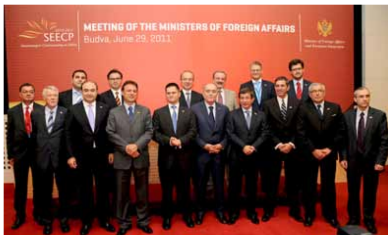
Participants of the meeting of South-East European Cooperation Process Ministers of Foreign Affairs, held in Bečići, Montenegro, on 29 June 2011.

they exist. Due to the efforts of different regional and other stakeholders a substantial improvement in the cooperation in this area has been registered. However, a continuous engagement is important aimed towards recognizing the indispensable role of public service media and creating conditions for their full contribution to building democratic, pluralistic, tolerant and inclusive societies in SEE. An increased involvement of civil society in numerous regional activities promoted further the voice of the citizens in the process of fulfilment the domestic reforms and EU accession criteria. The regional cooperation in general benefited from the engagement of civil society which contributed to launching of common activities or to consolidating cooperation and keeping permanent dialogue with different civil society organizations (CSO) stakeholders and CSO networks from the region.