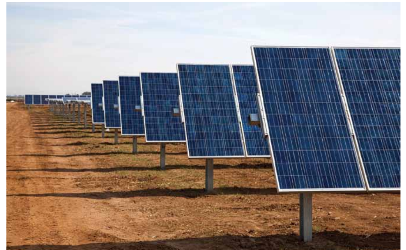
The RCC Secretariat has been active in promoting sustainable energy development as a key to "green economy".

The RCC Secretariat stressed the need for a Regional Energy Strategy (RES) and actively participates in the RES Task Force responsible to prepare this Strategy. RES will contribute to establishing and taking regionally