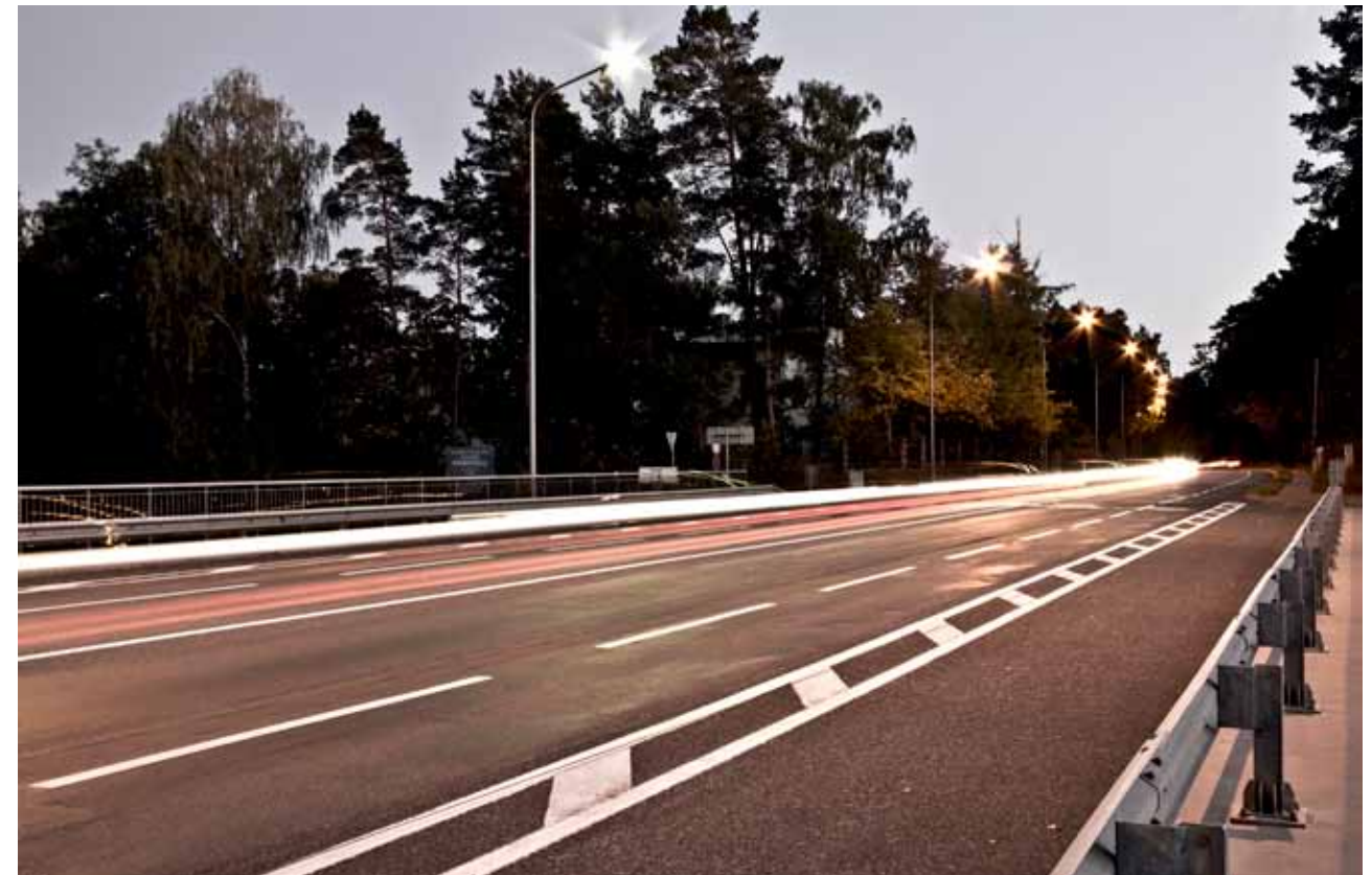
The RCC Secretariat has continued with its efforts to further strengthen cooperation and consultations with different partners.

the efficiency and effectiveness of the RCC Secretariat, conclusions and recommendations in view of better implementation of the next phase of RCC SWP 2011 - 2013, and programming of the RCC's strategy for the next period 2014-2016. The Self-assessment Report was broadly welcomed and praised by the RCC Board members.