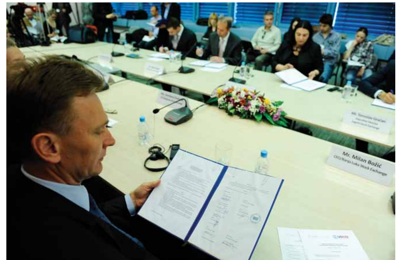
Directors of eight South East European stock exchanges signed a Platform for Joint Action under RCC Secretariat's auspices, in Sarajevo, Bosnia and Herzegovina, on 27 March 2012.

An important feature of this approach is the agreement to formulate regional political headline targets, convert them into measurable and time-bound indicators and monitor performance on regular basis. This would represent a considerable evolution in the character of regional cooperation by positioning the countries in