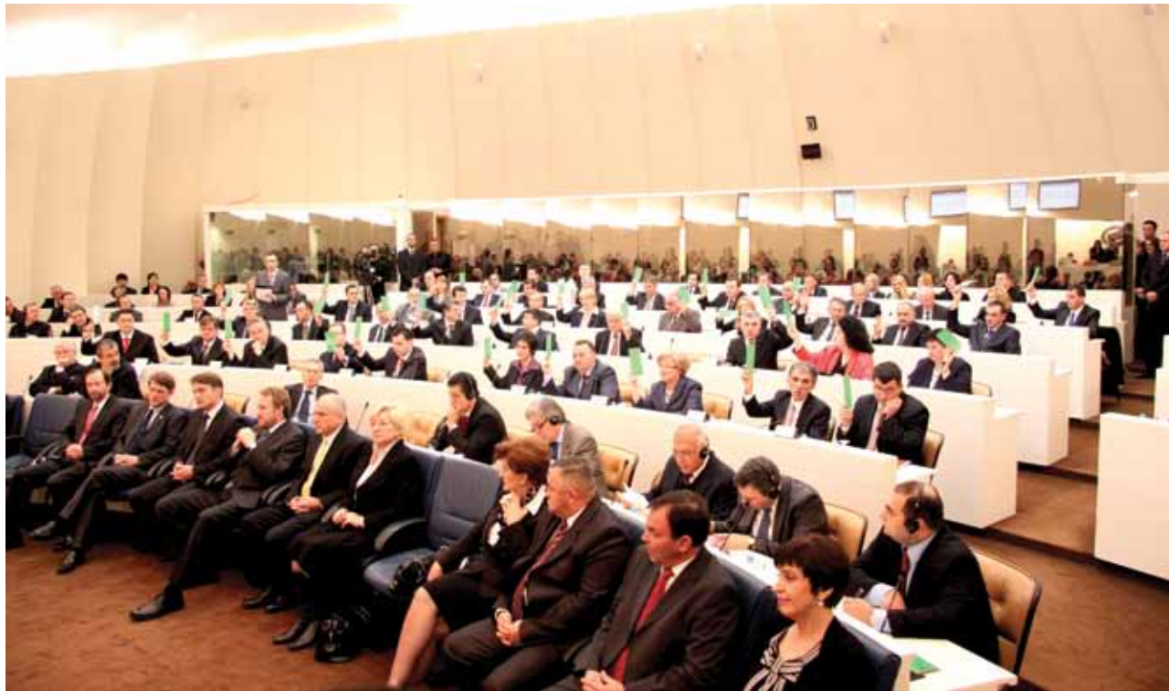
The RCC Secretariat has actively assisted the SEEC in the efforts to develop its parliamentary dimension.

Parliamentary cooperation in SEE needs to be streamlined, directed towards strengthening capacities of the main legislative bodies in fulfilling their various important roles in state governing systems. Regional stakeholders – national parliaments, SEEC C-i-O, RCC, Regional Secretariat for Parliamentary Cooperation and COSAP, as well as key international partners such as EP and EC – should join efforts in developing more realistic and result oriented approach among main legislative bodies in SEE and the Western Balkans in particular. Therefore, the RCC Secretariat will also facilitate and assist national parliaments from the region to exchange best practices and cooperate in different priority areas, particularly on issues related to EU integration.