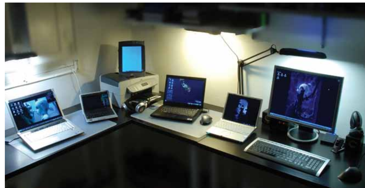
Several areas of convergence and complementarities between justice and security cooperation were identified among regional organizations, including cyber security and defence.

sharing best practices at the regional level regarding protection of fundamental rights within justice and security cooperation areas, as well as managed to cluster initiatives of national authorities, professional associations of the judiciary, regional and international organisations and to create regional forums for dialogue on civil matters and fundamental rights.