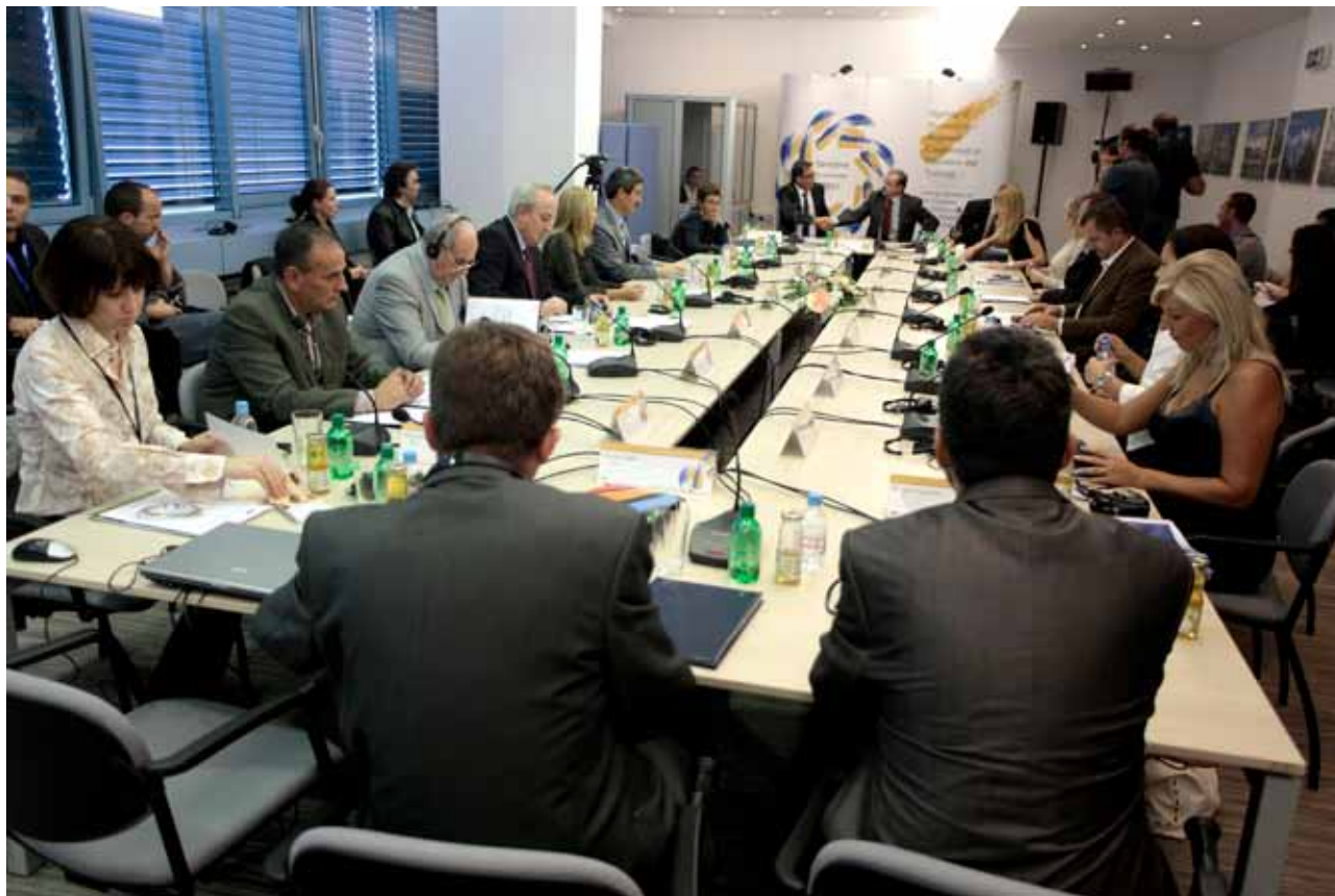
Protocol on Regional Cooperation in Education and Training among members of the European Association of Public Service Media in South East Europe, was signed under RCC auspices in Sarajevo, Bosnia and Herzegovina, on 30 September 2011.

Another difficulty is that many public broadcasters in the region have still not fully completed the transition from a state into a public broadcaster, as well as from analogue to digital broadcasting, an additional burden in itself both in terms of human and financial resources. The most common obstacles to switch-over are the lack of political will, relevant legislation and related strategy, as well as funds to implement the legislation and strategies where they exist.