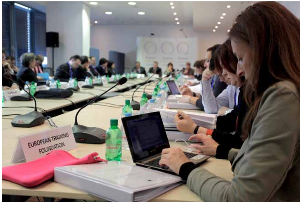
10th meeting of the South East Europe Investment Committee took place under RCC Secretariat's umbrella, in Sarajevo, Bosnia and Herzegovina, on 24-25 April 2012.

In order to provide detailed analysis of the first year (2011) of implementation of the RCC SWP 2011-2013, the RCC Secretariat has, on its own initiative, launched a self-assessment process with a primary objective to assess fulfilment of the set objectives, as well as to estimate wider relevance, impact and sustainability of the activities performed. The process resulted with the Self-assessment Report presenting an evaluation of the results achieved and the identified gaps and obstacles,