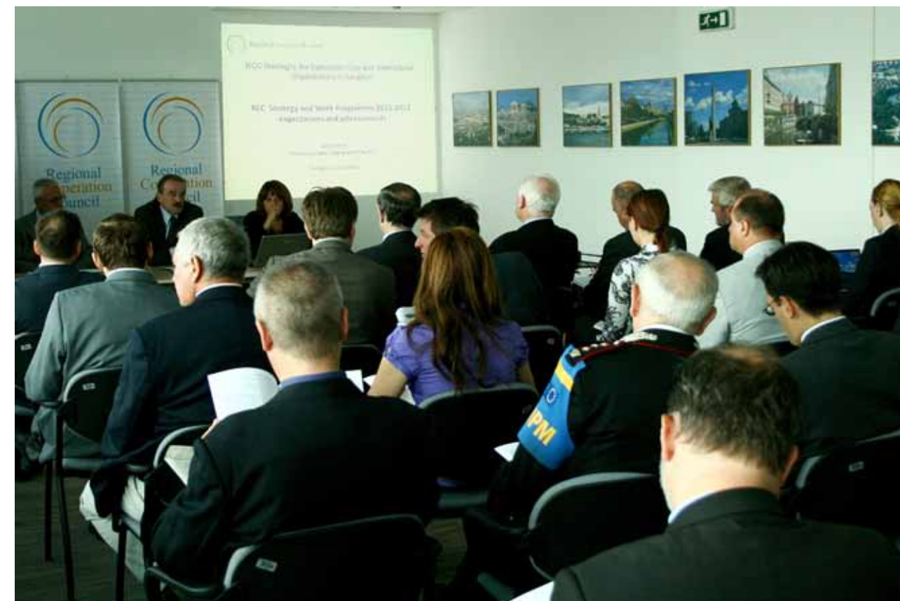
Representatives of diplomatic community in Sarajevo at RCC Secretariat's briefing on the first year of implementation of its Strategy and Work Programme 2011-2013 and results of the third RCC Annual Meeting, held in Sarajevo, Bosnia and Herzegovina, 5 July 2011.

The recommendations of the Enlargement Strategy and the conclusions and decisions of the EU on enlargement and stabilisation and association process also pointed to the need for tangible results of regional cooperation. The dialogue of the RCC Secretary General and the RCC Secretariat with the EU institutions, in particular with the European Commission (EC), played an important role in this context and demonstrated the possibility of associating RCC even closer to the Enlargement Agenda. The regular contacts with the European Parliament (EP), the European External Action Service (EEAS), the Presidencies of the Council of the EU and the General Secretariat of the Council contributed to fruitful cooperation with the EU institutions and were helpful in bringing a positive attention of the EU to the role of regional cooperation.